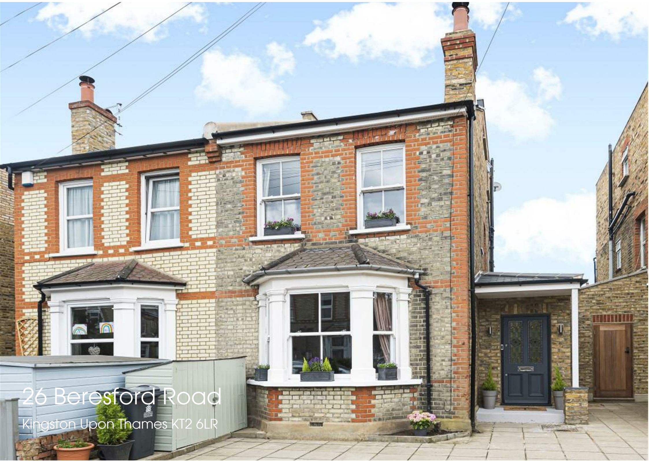
26 Beresford Road Kingston Upon Thames KT2 6LR

34 Richmond Road Kingston upon Thames Surrey KT2 6ED www.gibsonlane.co.uk Tel: 020 8546 5444